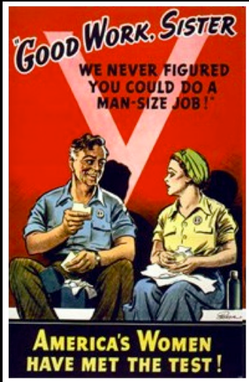
THAT WAS THEN