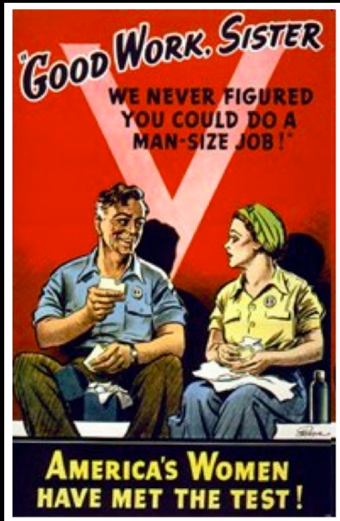
THAT WAS THEN